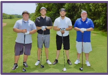
Team from Classic Chevrolet / Thompson Group at 2019 Classic Golf Tournament