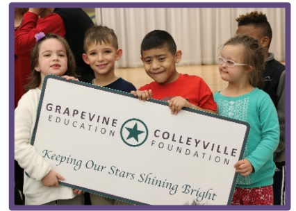
Students from Silver Lake Elementary School during 2019 Grant Patrol