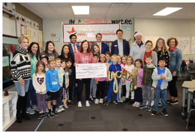
A Cannon Elementary School teacher receiving her oversized check during the 2022 STAR Grant Patrol